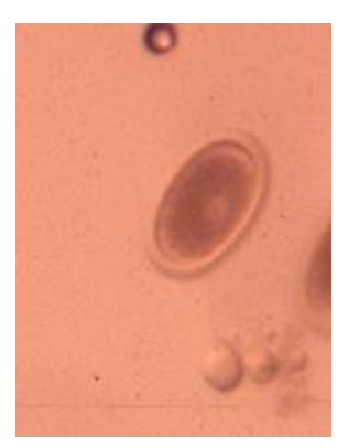
Ascarid (roundworm) egg