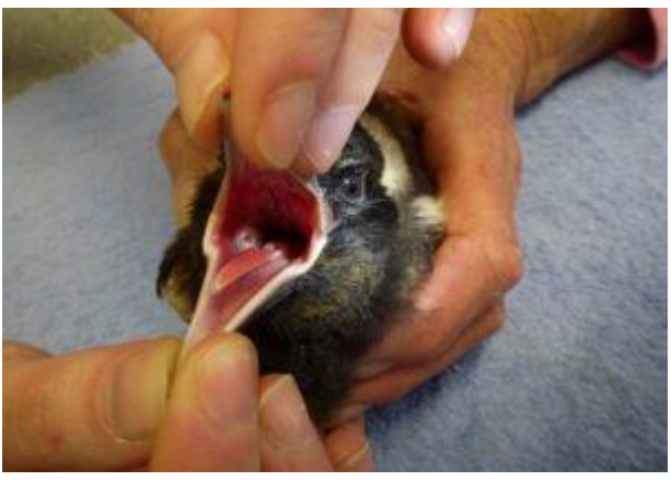
Spiruid worms in a juvenile magpie

In most cases tapeworms are not very pathogenic and cause only mild ill-health or loose droppings. The exception is with insectivorous finches, such as parrot finches, where it is not unusual for tapeworms to cause intestinal blockage and death.